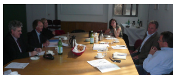
Meeting of the AEBR Task Force “CB Health” in Essen/Germany, 13.04.2010

On 13 April, the AEBR Task Force “Cross-Border Health” met in Essen/Germany. For the full report with the main results, please visit http://www.aebr.net/news/news_aebr.php?lc=en&nid=288#288 .