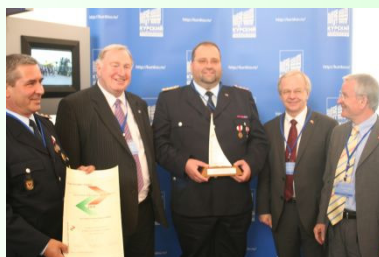
Representatives of the fire brigade receiving their award.

http://www.aebr.eu/en/news/news_detail.php?news_id=114