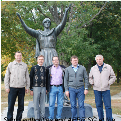
Sumy authorities and AEBR SG at the Yaroslavna memorial in Putyvl.