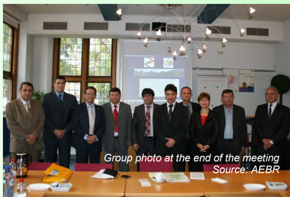
Group photo at the end of the meeting

http://www.aebr.eu/en/news/news_detail.php?news_id=116