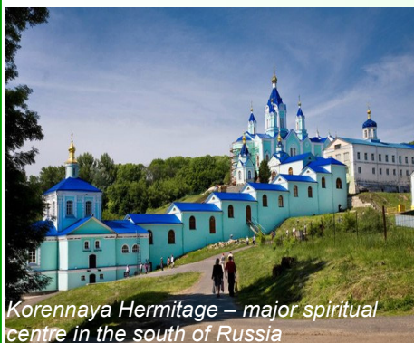
Korennaya Hermitage – major spiritual centre in the south of Russia

The requests and recommendations of the forum in Moscow and of the Annual Conference in Kursk will address the EU, Russian