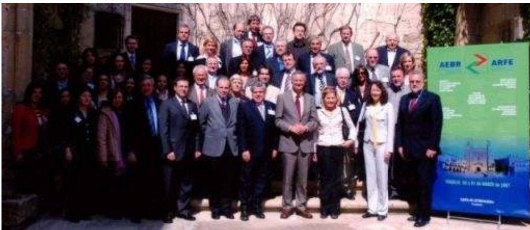
Participants of the AEBR Executive Committee meeting in Trujillo, 3 March 2007