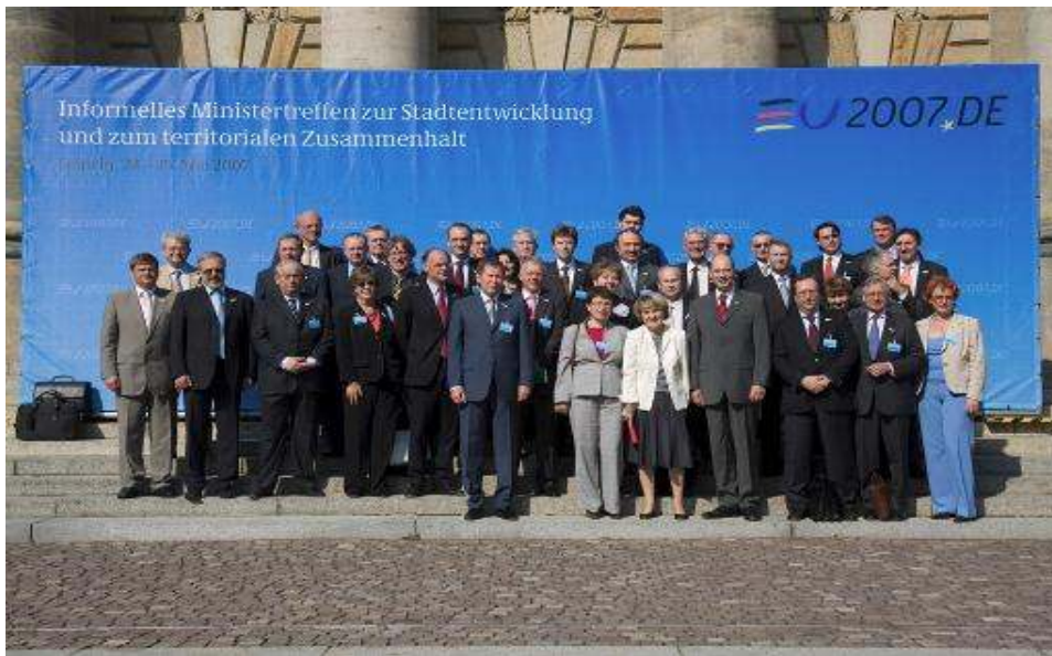
Group picture of the Ministers for Territorial Cohesion

For further information please see: www.bmvbs.de/eu2007 .