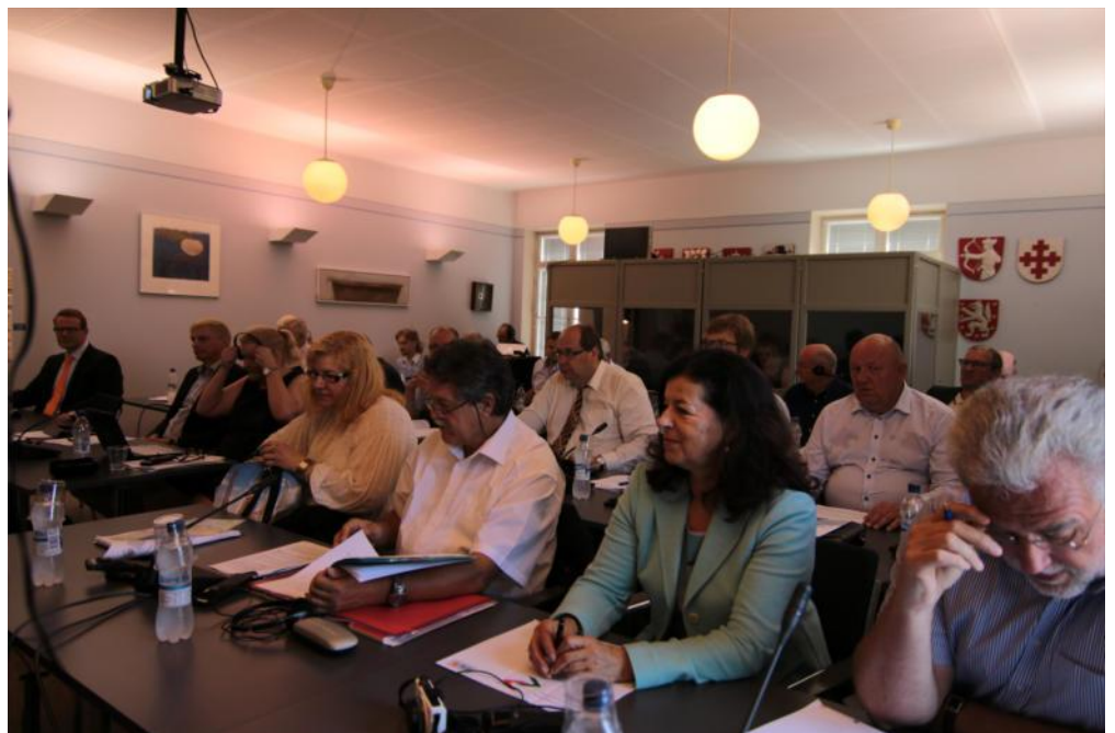
AEBR Executive Committee meeting in Joensuu, Finland in June 2014