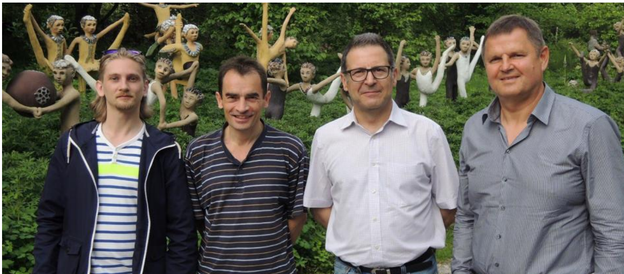
Meeting of the Task Force External Borders in Parikkala in June 2014

In 2014, the AEBR made a strong effort to strengthen its involvement at the external borders of the EU and far beyond. The cooperation with border areas at the external borders has been further developed in the past years. Several meetings with representatives of border regions at the external borders of the EU took place in the framework of the Task Force on External Borders (TFEB). Of particular importance were in this context events organised in June 2014 in Finland in cooperation with the member regions of the AEBR North Karelia and South Karelia.