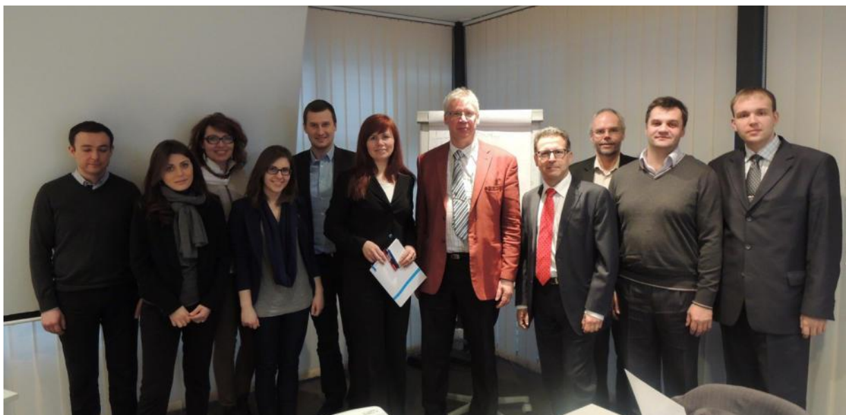
Stakeholders of the "ComUnYouth" project in Tallinn in February 2014