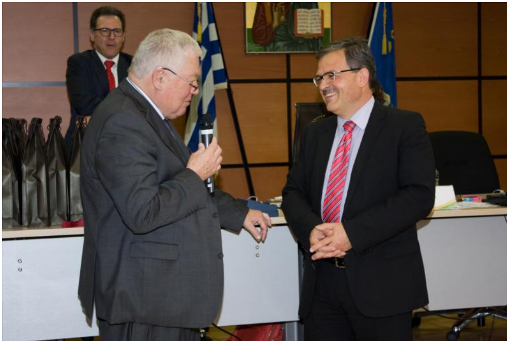
AEBR Executive Committee meeting in Drama, Euroregion Nestos-Mesta (Greece) in March 2014