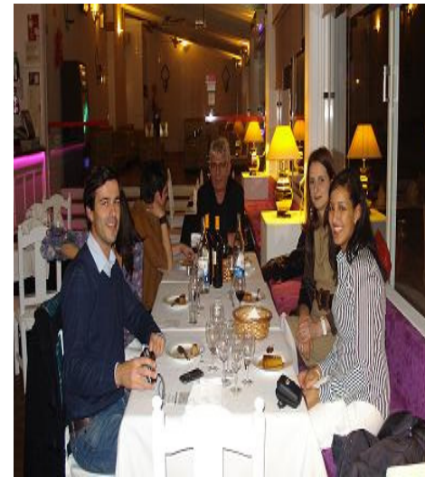
Welcome dinner at the Jardim do Paço, Evora

This palace was used by the governor of the city of Évora and served, from time to time, as royal residence. The first-floor rooms house a collection manuscripts, family portraits and religious art from the 16th century, which can be visited by the public. The Garden has been recuperated, in middle 80s, and became a charme restaurant.