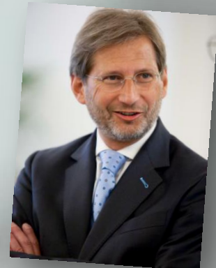
2014: The Cross Border Award “Sail of Papenburg” under the patronage of Johannes Hahn (European Commissioner for Regional Policy).