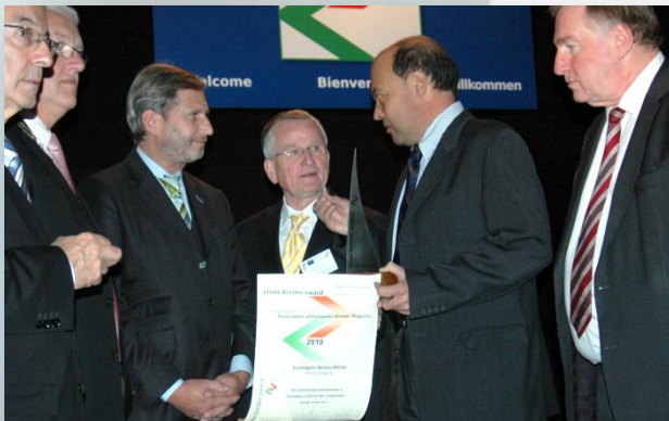
2010: Johannes Hahn, European Commissioner for Regional Policy, attended the Award ceremony.